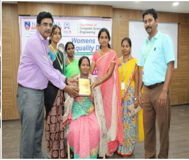
felicitations to the resource person by CSE HOD & staff